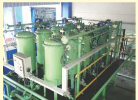
Centralised System at SKF