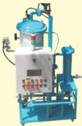
Honing Machine Bajaj Auto