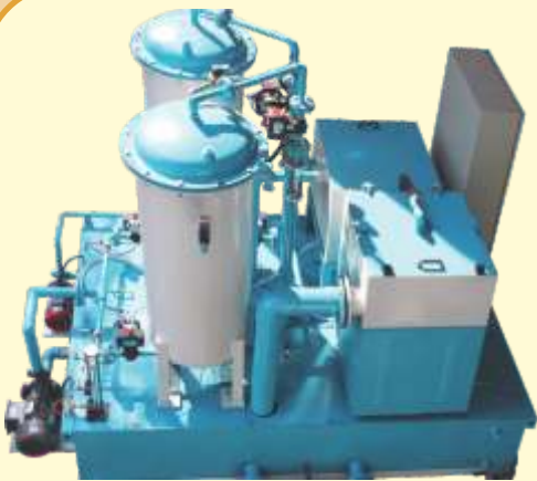
'120 lpm carbide grinding filtration system at Aayudh Tools, Aurangabad'