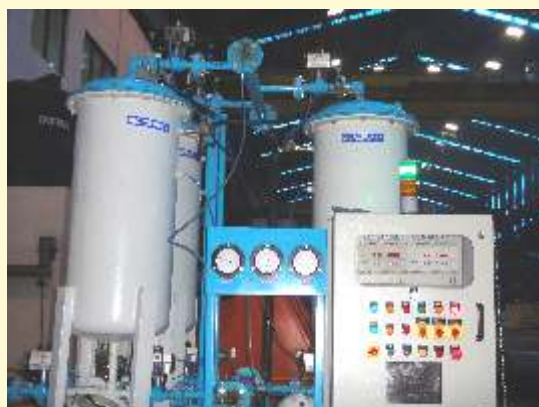
EDT Filtration - Waldrich Siegen Machine (Bhushan Steel )